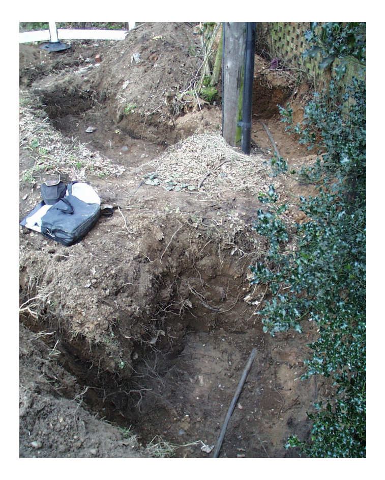
Pl. 3 Site area looking north, Trench 4 in foreground.