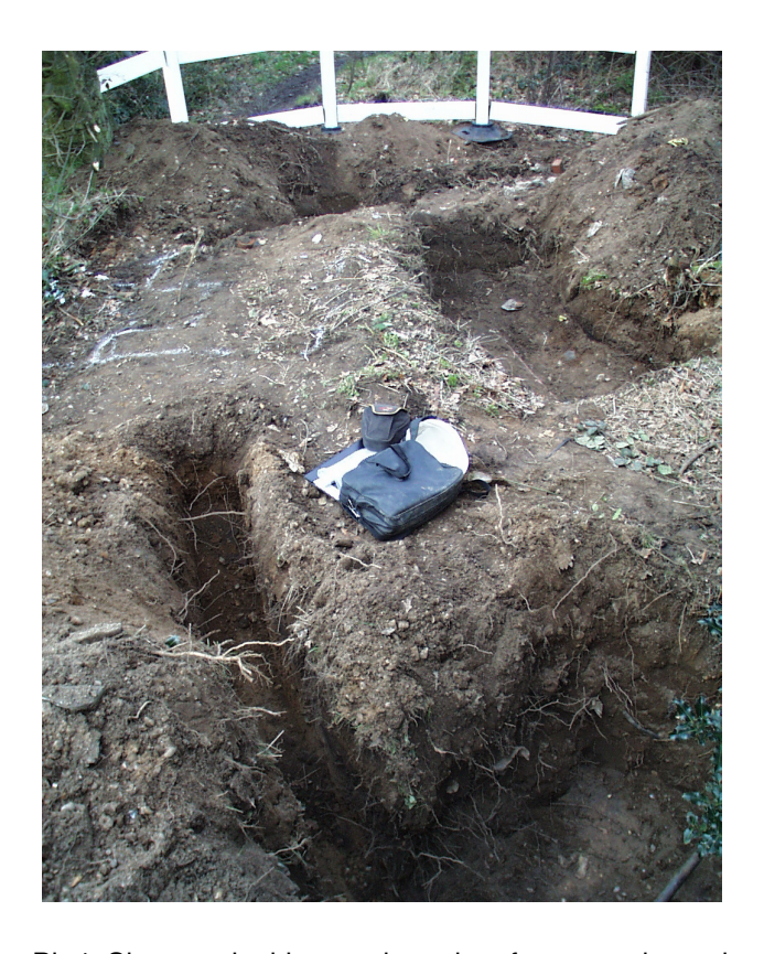
Pl. 4 Site area looking north to site of proposed trench (middle left of picture), Trench 4 in foreground.