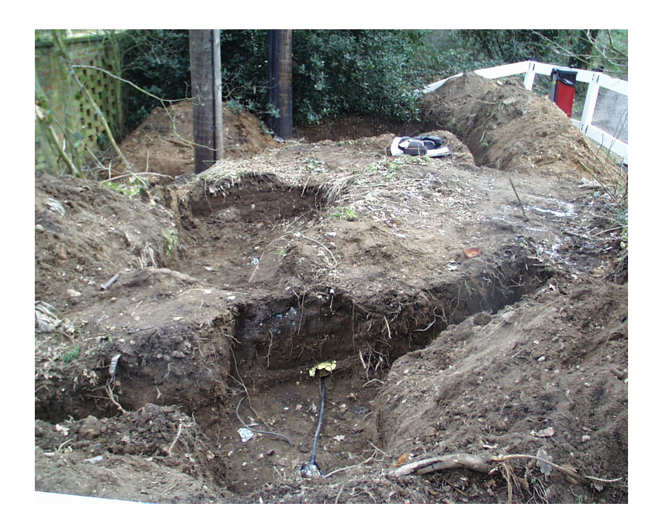
Pl. 2 Site area looking south, Trench 1 in foreground.