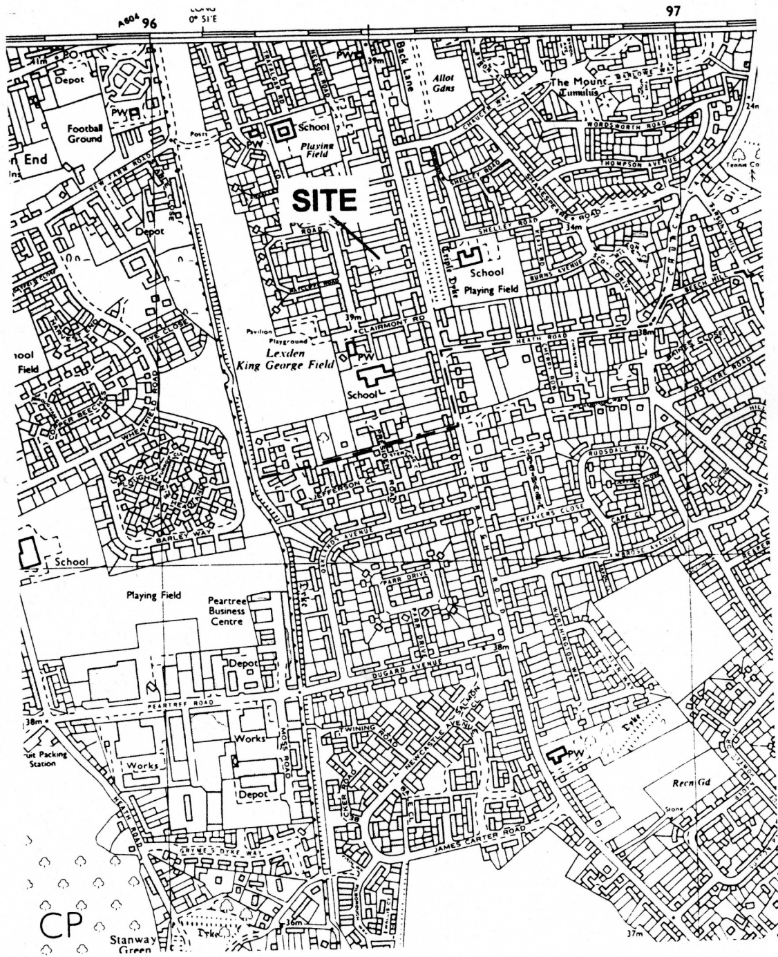
Figure 1. Location plan