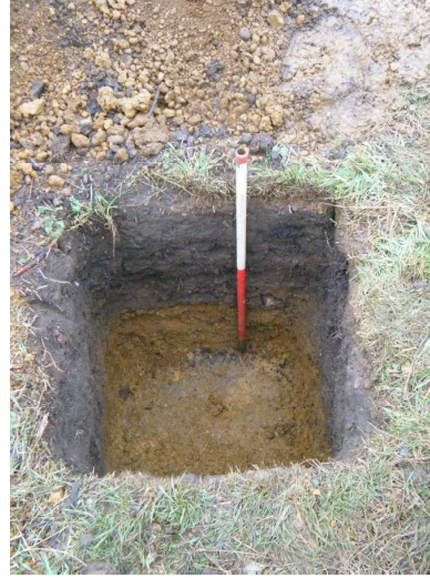
Plate 2: Pit 1, view north.