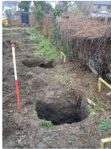
Plate 3: Pits 9 & 12, view north-east.