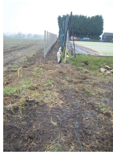
Plate 4: The badger control fence (foreground) and the new footpath, view west.