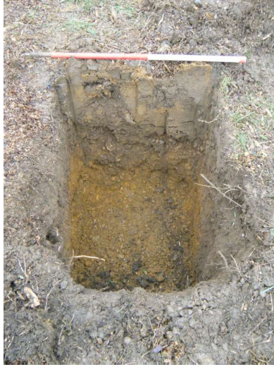
Plate 1: Pit 5, view north.