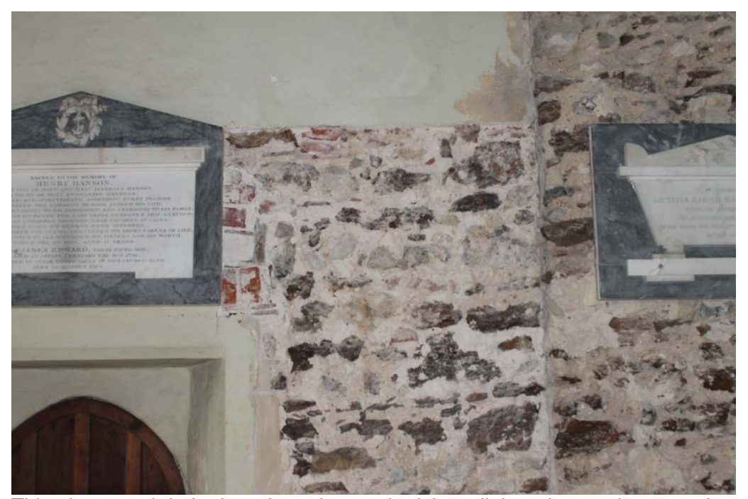
This photograph is farther along the south aisle wall than the previous two. It appears to show two different building styles (ie, periods) near this small door. To the right is older work (original south aisle?) and to the left is more recent work with the external door (extension to south aisle).