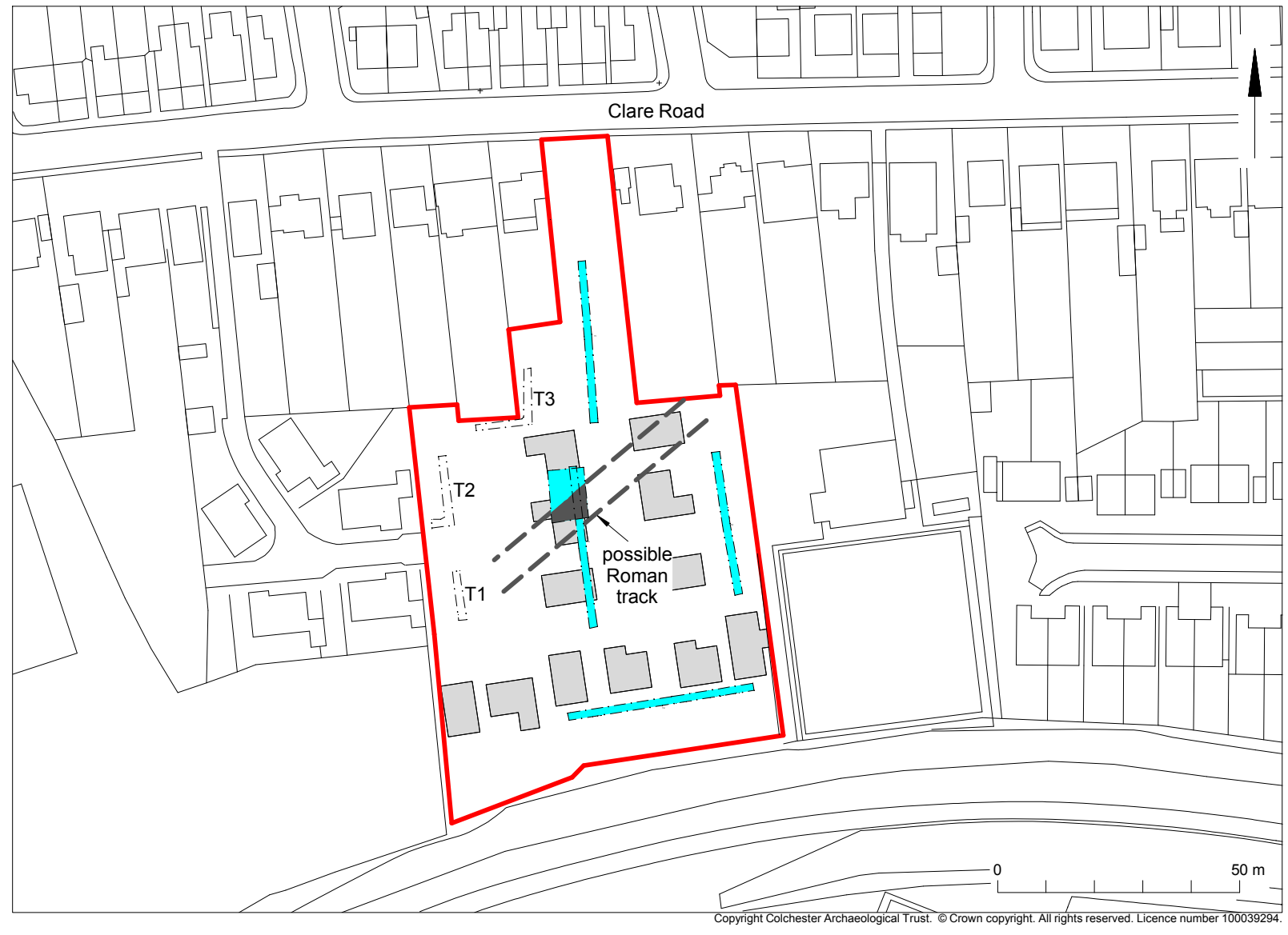
Fig 1 Site location showing the 2014 evaluation trenches (T1-3) in relation to the 2012 evaluation and excavation.