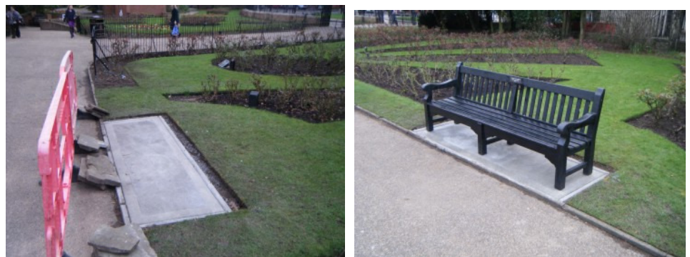
Photograph 5-6 Base slab laid and bench in new position, looking SE