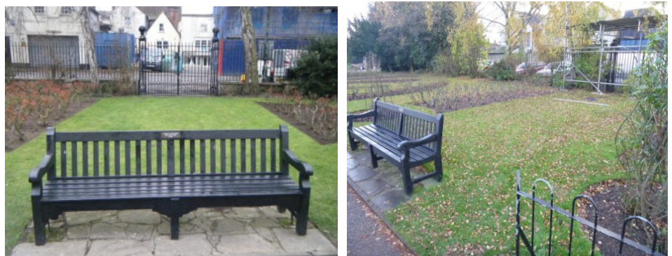
Photograph 7-8 Pre-excavation shots, looking S and SE

The new path was machine-dug under archaeological supervision. It measured 12.5m long by 3.8m wide. It was excavated through c 200mm of modern topsoil (L1). Residual fragments of Roman CBM, oyster shell and opus signinum was observed in the topsoil along with fragments of tarmac and modern brick.