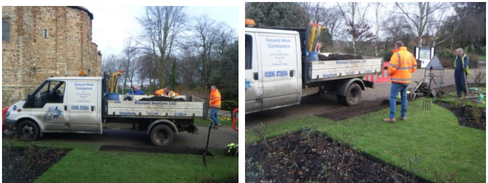
Photograph 3-4 Mid-excavation shots of both bench bases, looking N and NE