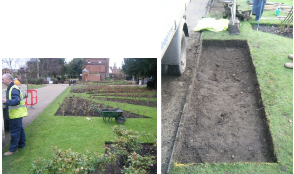
Photograph 1-2 Pre-excavation and mid-excavation shots, looking W

Two park benches were relocated as part of the reinstatement of the former entrance. Two foundations were hand-dug by the contractors under archaeological supervision. They measured 3m long by 1m wide and were excavated through c 200mm of modern topsoil (L1). Residual fragments of Roman CBM were observed in the topsoil along with fragments of modern flowerpot, glass and coal/clinker (none retained).