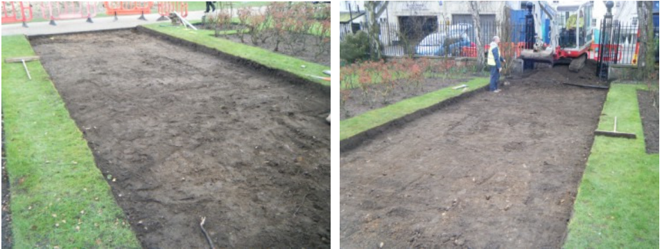
Photograph 9-10 Mid-excavation shots, looking NE and SE