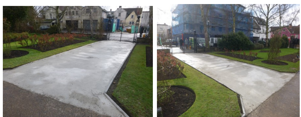
Photograph 11-12 New entrance completed, looking SE and SW