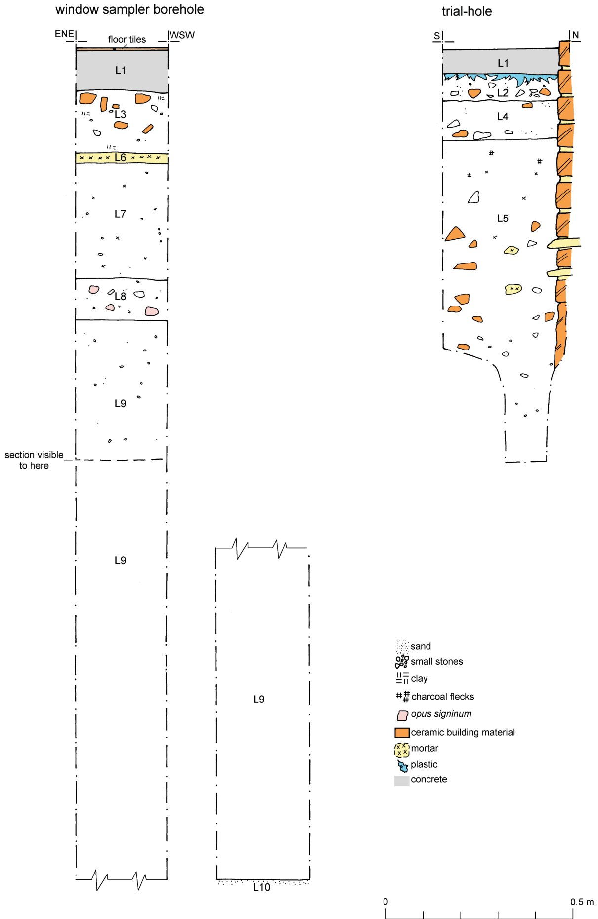
Fig 3 Representative sections.