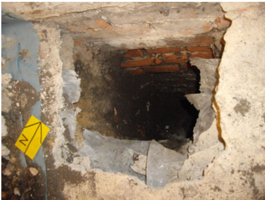
Photograph 1 Trial-hole, looking NW

of pottery, brick/tile and animal bone in section. Natural sands were encountered at a depth of 3.2m below current ground level.