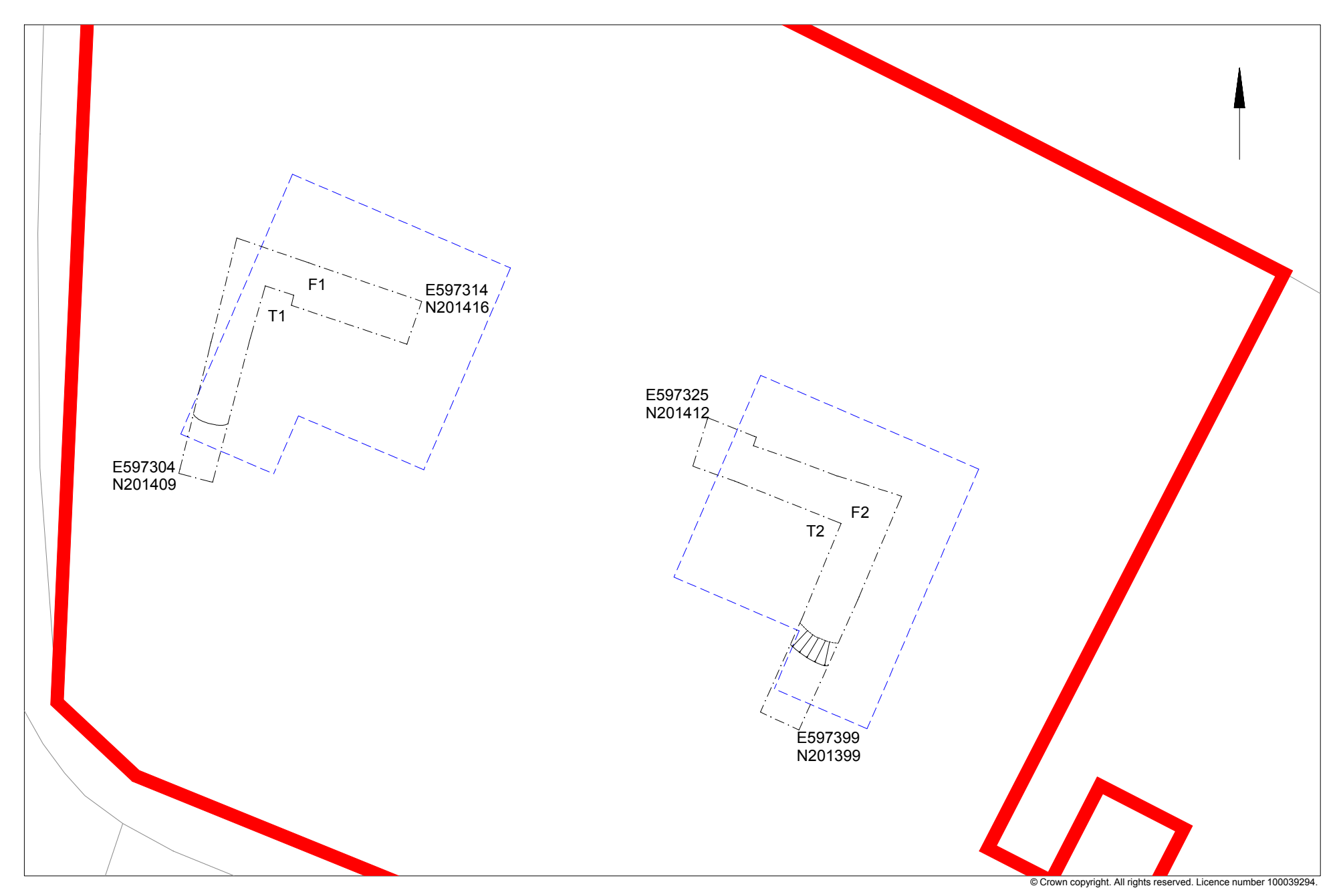
Fig 2 Results (proposed development dashed blue)