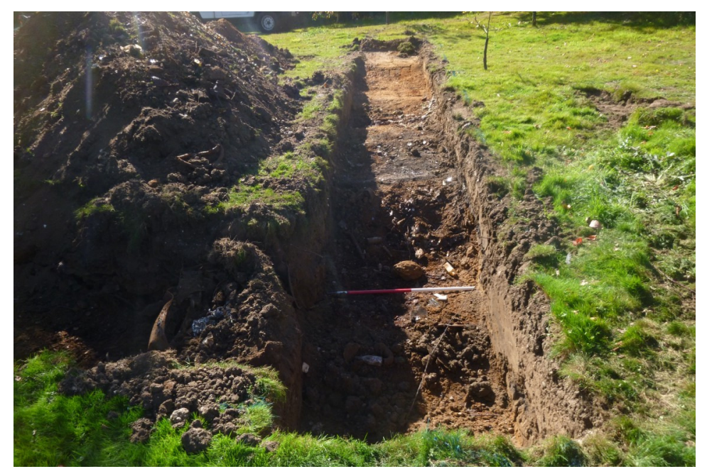
Photograph 1 T1 trench shot - looking south southwest

Modern refuse pit F1 extended across most of the trench. The dimensions of the feature could not be determined but it measured at least 0.45m deep.