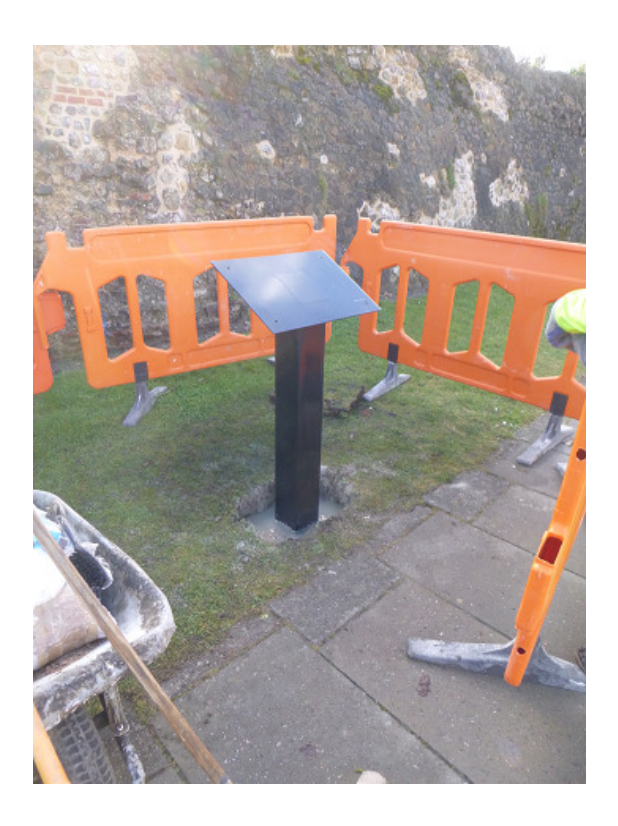
Photograph 1 In-situ board, looking south west

All excavations were carried out by contractors under archaeological supervision. A square hole measuring 0.5m x 0.5m and 0.65m deep was excavated through modern topsoil (L1 0.2m thick, loose dry medium grey/brown silt) onto a layer of modern backfill (L2 0.45m thick, firm dry grey/brown silt with frequent concrete, brick and tarmac inclusions).