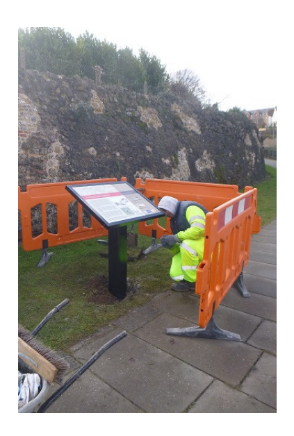
by Ben Holloway figures by Ben Holloway