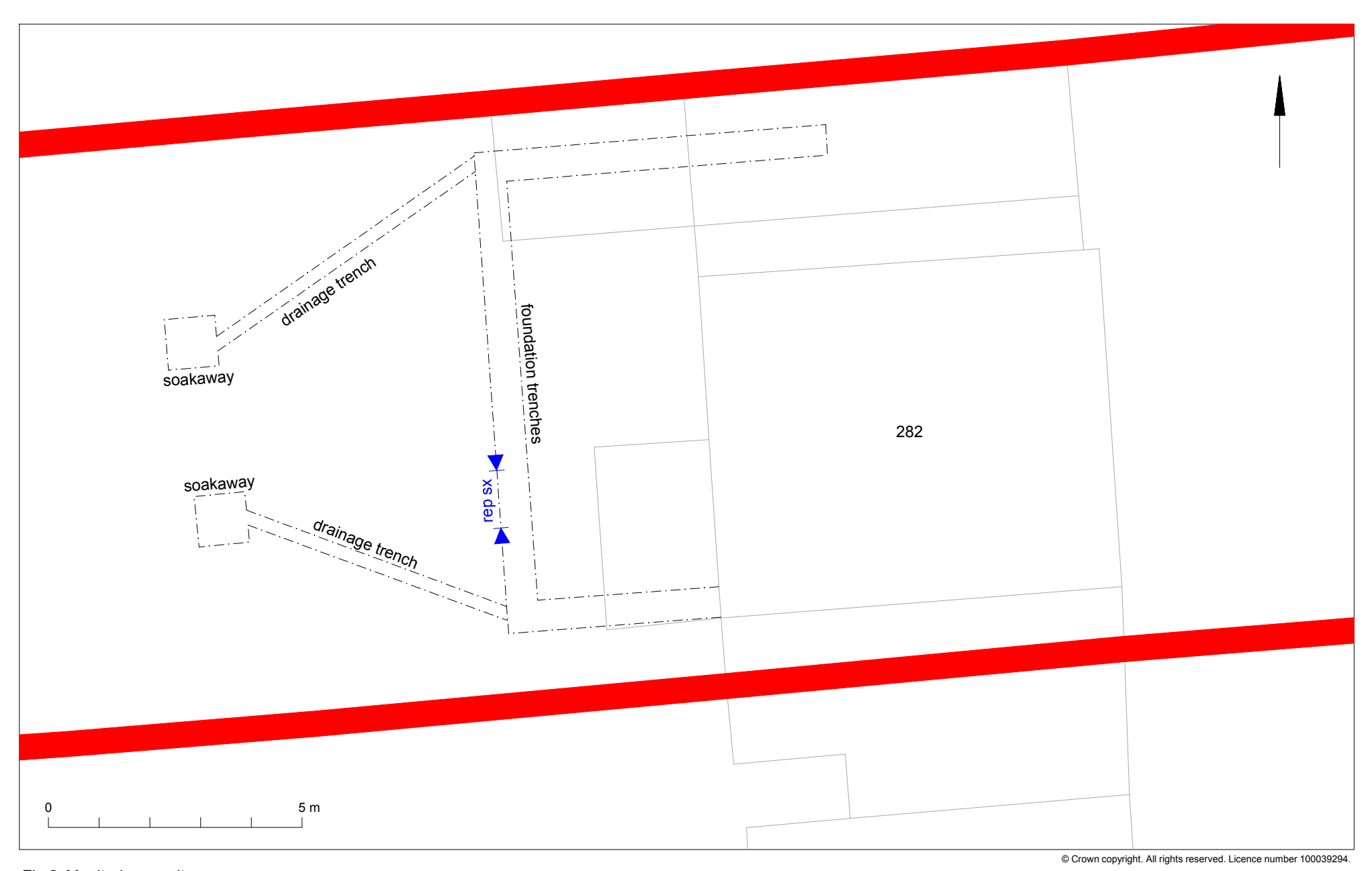
Fig 2 Monitoring results.