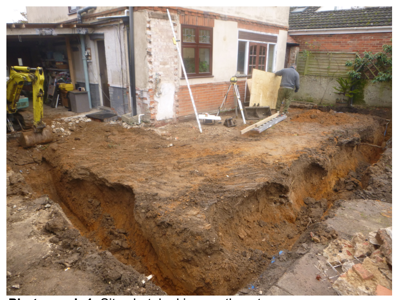
Photograph 1 Site shot, looking southeast

No significant archaeological remains were encountered.