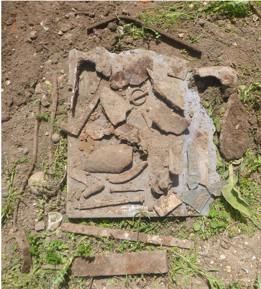
Photograph 2 Post-medieval/modern ironwork from the spoil heap

Several pieces of post-medieval/modern ironwork were found in the spoil heap with a metal-detector. These items were photographed (see below) and left on site.