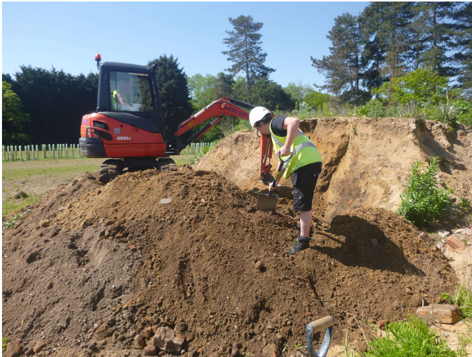
Photograph 1 Searching through the spoil heap

The swimming pool is located within the eastern walled garden and measured 12m long by 6m wide and 1.7m deep (Fig 2). Spoil from the excavation of the pool had been retained on site, to the east of the walled garden, and a mechanical excavator was employed to spread the heap out over a wider area to assist with the search. The spoil was then dug through by hand by two CAT archaeologists for finds retrieval. A metal-detector was also used.